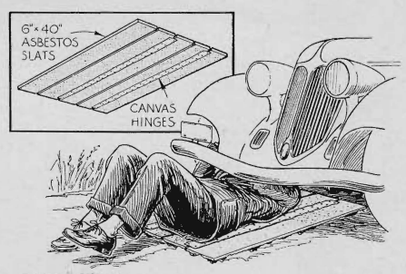
Folding "dolly" in use for roadside repair work

\mathbf{F}_{\text{the}}^{\text{ROM}} a sheet of asbestos or wall board, the car owner can make a handy portable "dolly" to protect his clothes when making repairs under his car. It consists simply of five slats, each six inches wide, hinged together with strips of stout can-vas or leather. By placing the hinges on alternate sides as shown below, the "dolly" can be folded.-J. L. M.