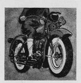
MOTORCYCLE. Driving and one clearance lamp front; tailstop rear. Dull all shiny areas

The masked opening of the tail-light unit takes the approximate shape of four V's lined up beside each other, with a wide space between the two center ones giving the appearance of two separated pairs of V's to the lineup. From some