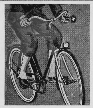
BICYCLE. Amber reflector at front; red, rear. Whiten lower parts. Blackout flash is urged

Mounting calls for critical adjustment so that the slot is level and the beam projects straight forward.