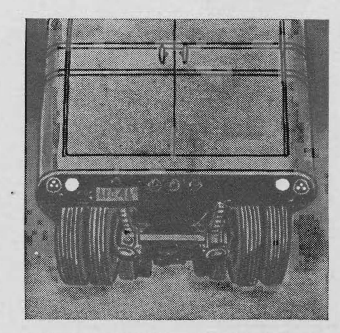
WIDE MOTOR VEHICLES. Extra tail-stop lamp plus special reflectors at sides, rear, front

Vehicles 80 inches or more wide must carry extra combination tail and stop lights on the extreme right rear, balancing the left rear ones. Also, two approved red reflectors must be attached no higher than 30 inches on the extreme rear near the sides. as well as two amber ones at front near the sides. If over 35 feet long, a vehicle must also display lowmounted red reflectors on the sides near the rear, and amber ones on the sides near the middle and the front. Such side and rear reflectors are strongly recommended for all vehicles, as is flat-white or reflectorized paint on bumpers, hub caps, and lower portions of all vehicles. All shiny sur-