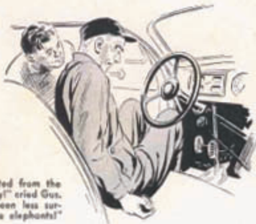
Water spouted from the panel. "Golly!" cried Gus. "I'd have been less surprised to see elephants!"

When they came back after a short run up the road Gus was looking puzzled and the expressman was looking worried. "She misses worst when she's pulling on the