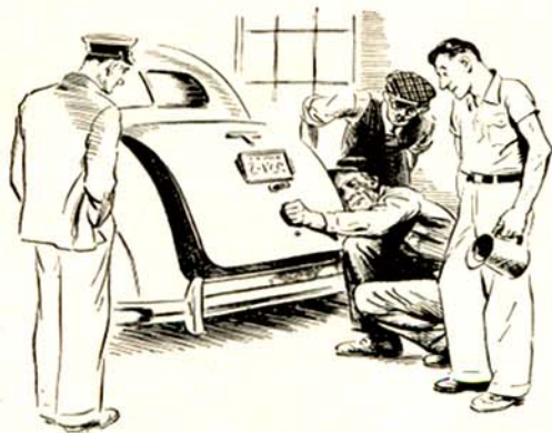
He lowered the door, stooping to watch the wires

Gus and Joe watched Harry escort the still-talking Mrs. Miller down the street. Then they looked at each other. "What a dame!" Joe said bitterly. "Imagine! Parking a burning car right up against our gas pump!"