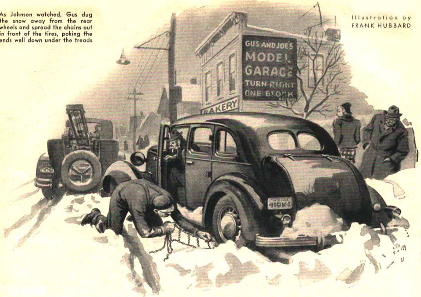
Illustration by FRANK HUBBARD

As Johnson watched, Gus dug the snow away from the rear wheels and spread the chains out in front of the tires, poking the ends well down under the treads