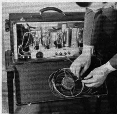
When not in use, the microphone can be stored in convenient clips mounted inside the cover

of maintaining its inductance rigidly at 150 milliamperes current. The dynamic speaker field (1,200 ohms) serves as the second choke.