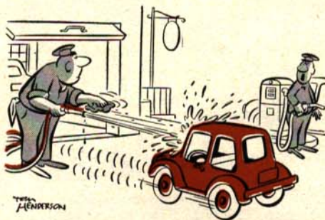
"The brake! Put the brake on!"