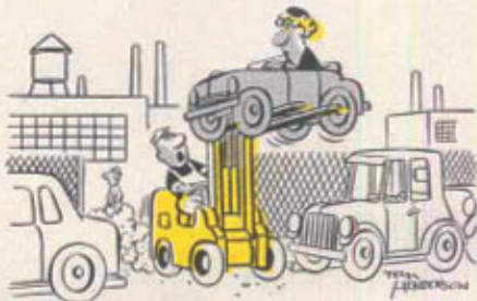
"Sorry, lady, but you're blocking this driveway."