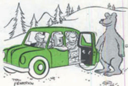
"I guess it's all right to get out... He seems friendly enough."

"This deal," he told Stan Hicks, "has about got me stumped. It would be use-