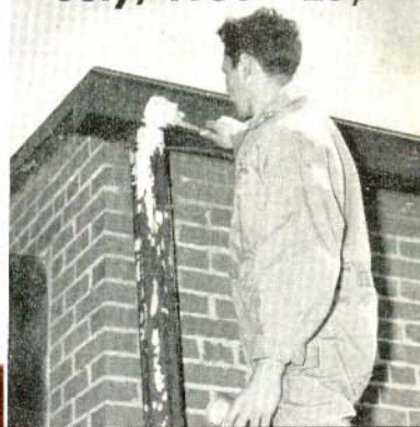
Patching With a Brush - p.218