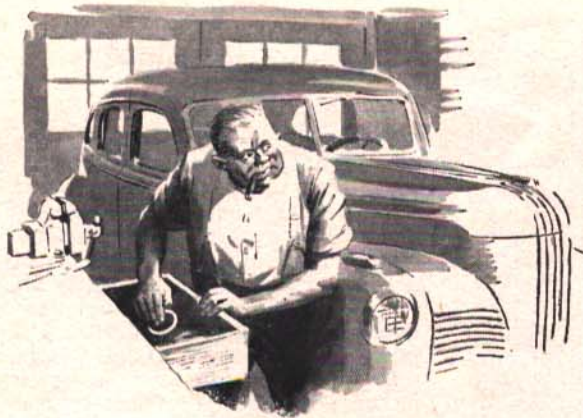
Someone had taken the gasket from the fuel-pump filter bowl and put it in a drawer of the workbench in the Mayor's garage

the extra Carpenter was going to publish as soon as the examination was finished.