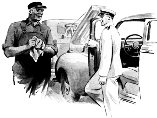
A young man in a Navy ensign's uniform jumped out of the car. "What's your trouble, Admiral?" Gus inquired