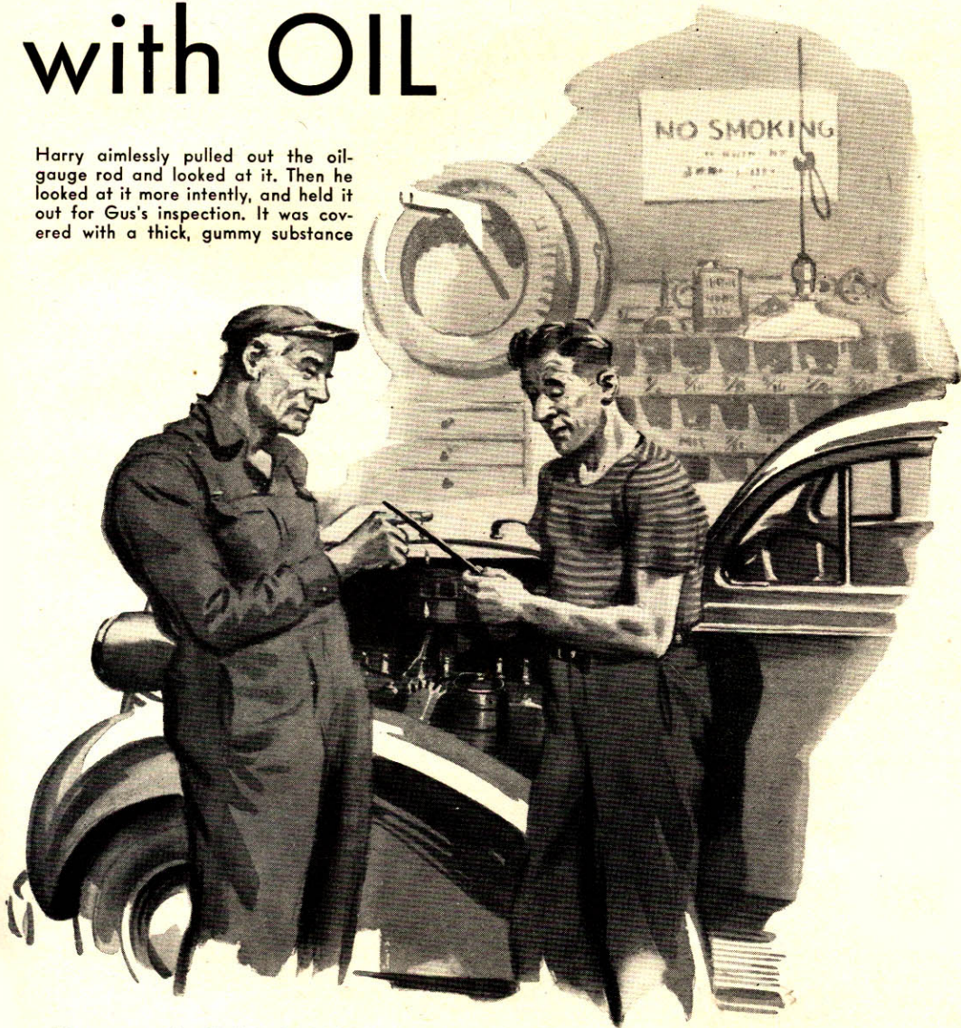
Illustrations by FRANK HUBBARD

Harry aimlessly pulled out the oil-gauge rod and looked at it. Then he looked at it more intently, and held it out for Gus's inspection. It was covered with a thick, gummy substance