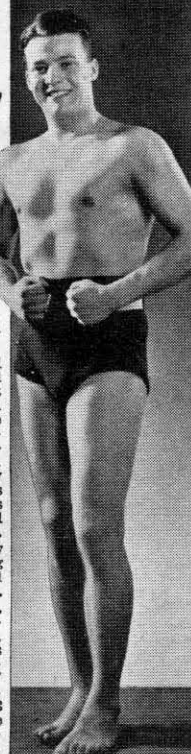
Posed by professional model

To start thousands building up their health right away, we make this FREE offer. Purchase a package of Ironized Yeast tablets at once, cut out the seal on the box and mail it to us with a clipping of this paragraph. We will send you a fascinating new book on health, "New Facts About Your Body." Remember, results with the very first package—or money refunded. At all druggists. Ironized Yeast Co., Inc., Dept. 453, Atlanta, Ga.