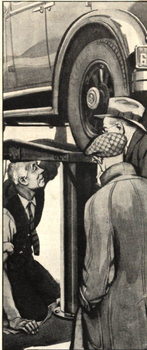
"You've sure been riding with Lady Luck and didn't know it," Gus said as he looked up at the underside of the car. "The front end of your drive shaft is ready to come loose."

"I don't think it's your motor," he belated over the clatter. "It must be your clutch or drive shaft. Let's go down to the garage so I can run it up on the greas-