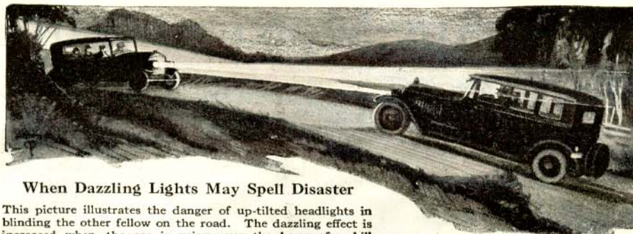
When Dazzling Lights May Spell Disaster

"Yes. Have the front lenses fit as nearly airtight and watertight as possible."