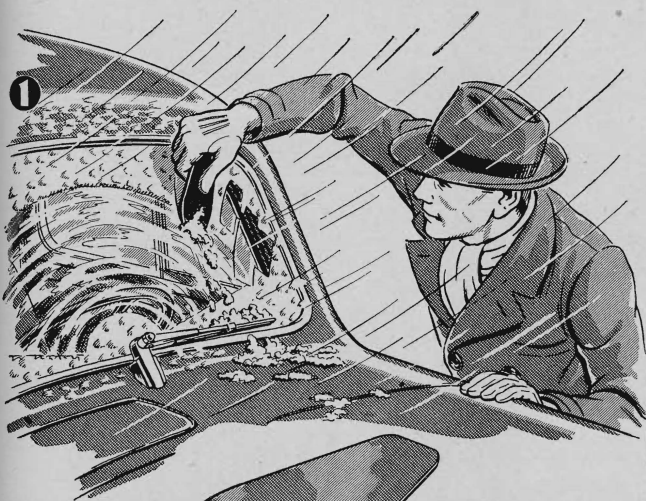
3"x7" ICE SCRAPER MADE OF THIN, HARD FIBER BOARD