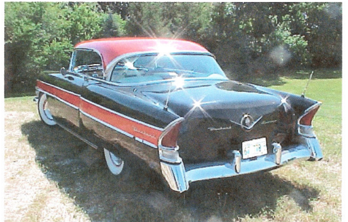
The 1956 Stelford Executive --- More than meets the eye!