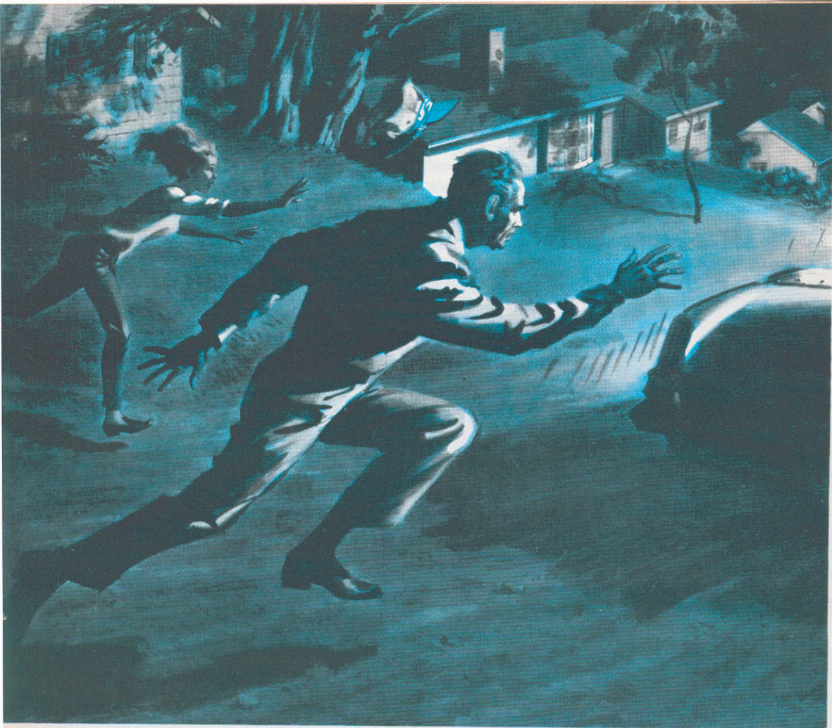
ILLUSTRATION BY RAY QUIGLEY