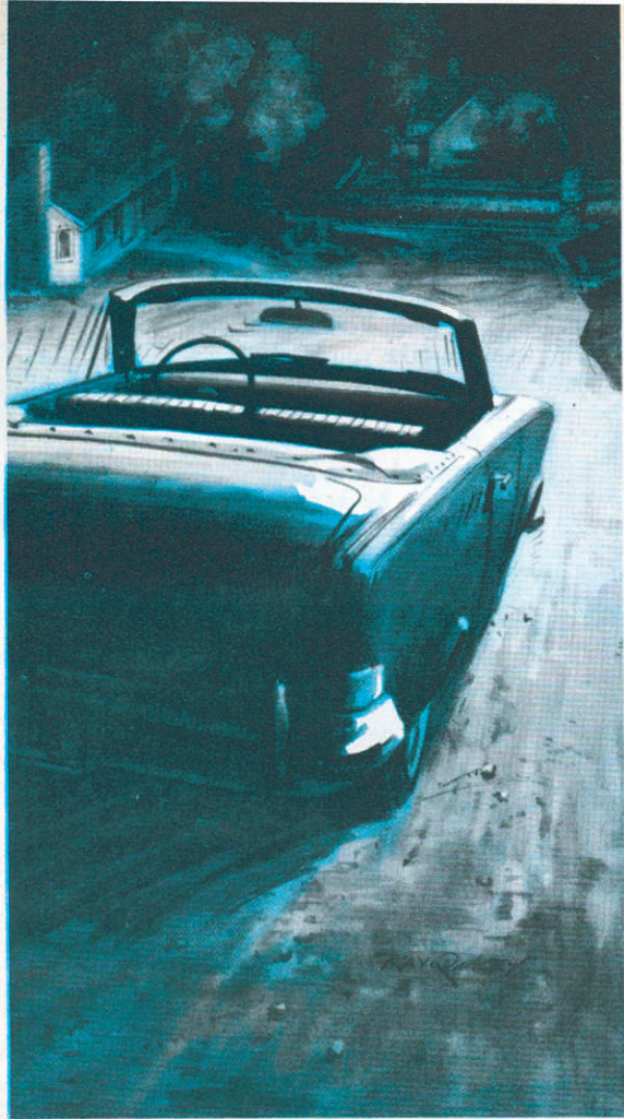
When Gus hit the street, the girl close behind him, the car was 30 feet away and gaining speed.