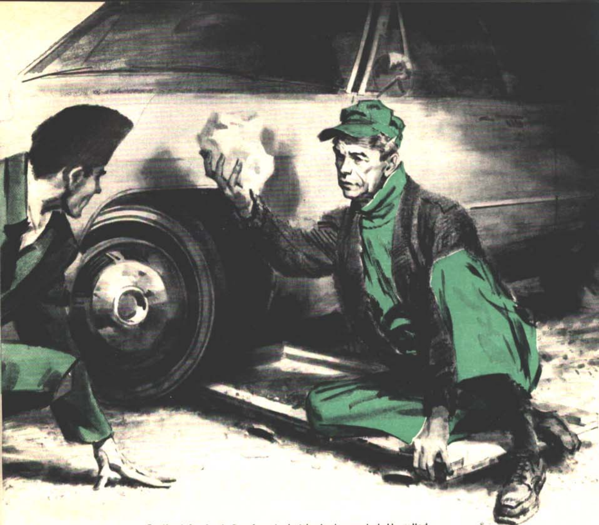
On the left wheel, Gus found what he had expected. He rolled out, in his hand a chunk of snow weighing at least two pounds.

she marched straight toward the men, heels clicking on the concrete floor, and blue eyes furious.