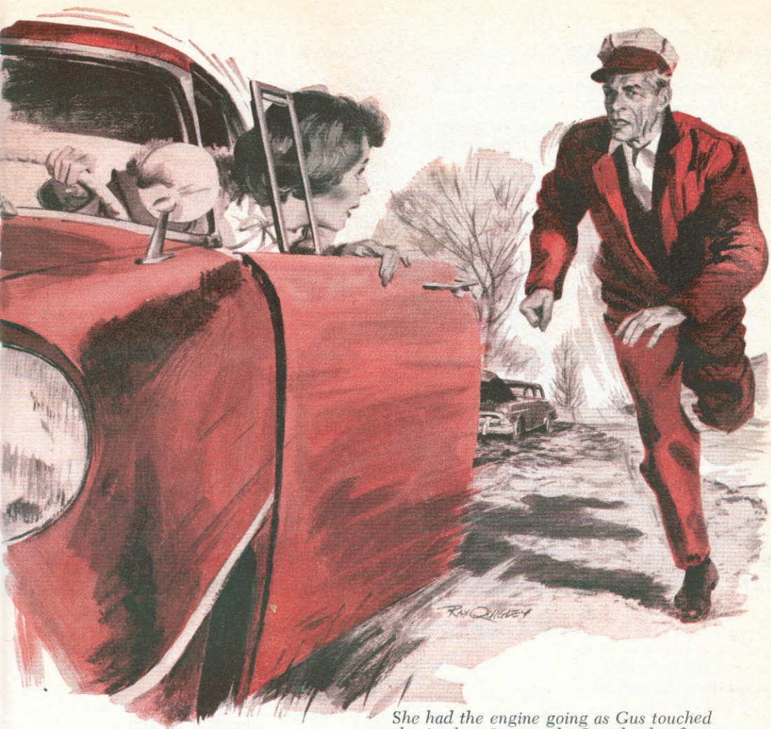
She had the engine going as Gus touched the fender. It moved off under his fingers.

You've got a nerve. Every time I stop, there you are behind me."