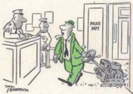
"I wish to report an accident."