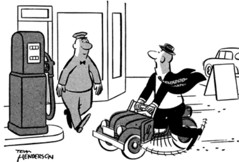
"Ran out of gas."