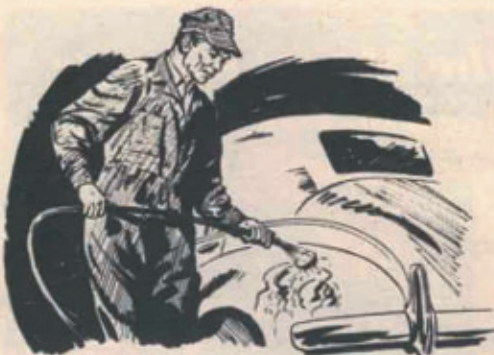
Gus turned the stream of water on the gas tank for half a minute. Then he unscrewed the cap.

said. He disconnected the line from the fuel pump to the carburetor and found it dry. Then he took the fuel pump off the car. In the trap there was water and ice. Gus told Stan to clean and wash the pump in gasoline.