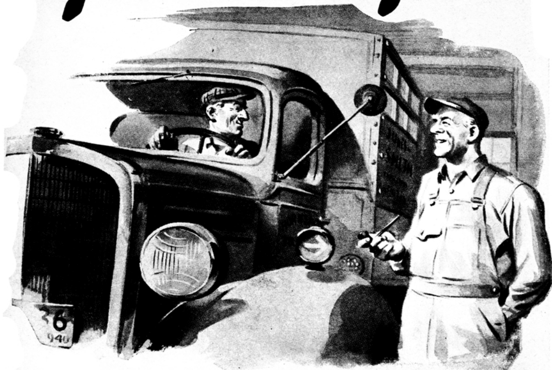
Gus lighted his pipe and stood with one hand in an overalls pocket, listening to the engine

"GOOD mornin', mister." Gus Wilson looked up at the little man who had come into the shop of the Model Garage so quietly that he hadn't heard him.