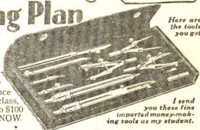
Here are the tools you get