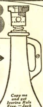
Copy me and get Looring Rule Free. —Jack

Building Work There will always be building. No structure can be erected without plans drawn by draftsmen. I'll make you an architectural draftsman at home.